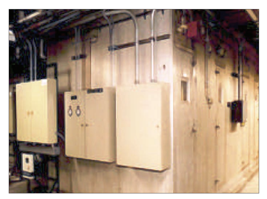
Figure 1: Air Handler Unit —Each AHU is designed to provide approximately 20,000 CFM of conditioned air to a space containing a volume of approximately 80,000 cubic feet, thus creating 15 air exchanges per hour or a fresh air turnover every four minutes.

Each AHU is designed to provide approximately 20,000 CFM of conditioned air to a space containing a volume of approximately 80,000 cubic feet, thus creating 15 air exchanges per hour or a fresh air turnover every four minutes. The dimensions of a typical CSRB AHU are 25 feet long, 10 feet wide, and 8 feet high (shown in Figure 1). Each AHU contains three distinct coils (reclaim, heat, and cooling) and is compartmentalized as designated in